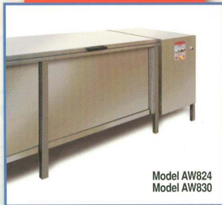
Model AW824 Model AW830

These washing machines have been engineered to clean rubber goods, especially the extra long line hose. With a single door on the top of the cabinet, and single door access to the drum, loading line hose has never been easier. The large 46" x 46" blankets are also easier to load into the machine. Dual automatic rinse cycles are standard on all washers.